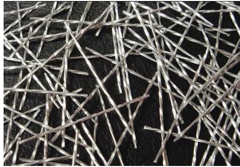
Figure 4. Twisted Fiber