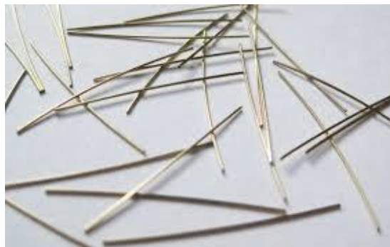
Figure 2. straight Fiber

STRAIGHT FIBER: Steel fibers are pieces of steel wire from 0.3 to 1.1 mm in diameter and from 15 to 50 mm in length of straight cross-section. A steel fiber is used for three-dimensional reinforcement of concrete and replaces steel mesh.